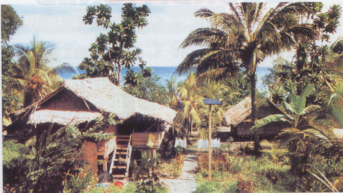
The old and the new...traditional housing and a solar panel in Sukiki village.