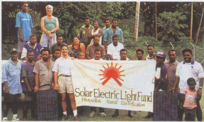
Proud and satisfied: The project brought a new mood to the village.

they have been dependent on buying kerosene to fuel their lamps. "Gone are the days when we have to spend up to $50 each month for our lamps. We do not have the trouble of having to look for kerosene and matches any more and our children can read and do their homework at night," he said.